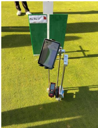
The Pro Par 3 Laser

The field will be limited to the first 20 teams to sign up. Round "one" will be conducted on separate days (2 foursomes per day) to accommodate a maximum of 20 teams (5 days). Round "two" will pit the overall winner of each flight in an 18-hole match.